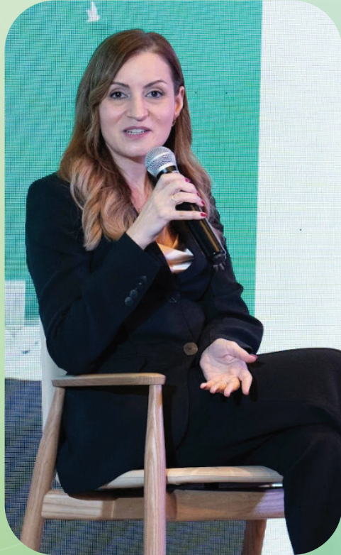
Patient Advocacy Group Participation