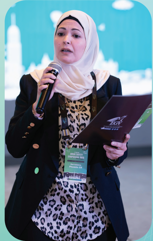
Practical Aspects of Risk Management Plans