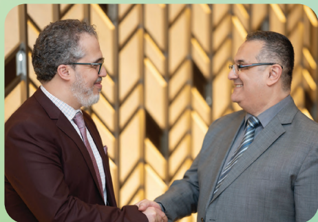
One-on-One Meetings with the Influencers