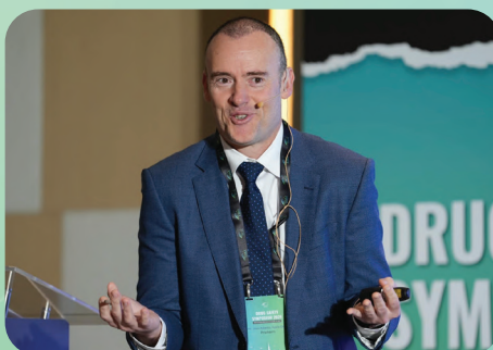
Brand yourself as Voice of the Industry