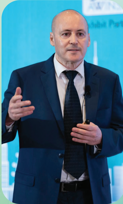
Mock Audit-Readiness with Hands-on Strategies