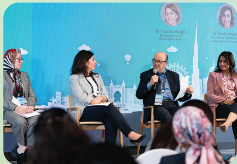
Meet and Learn from the Regulatory Leaders from across the Globe