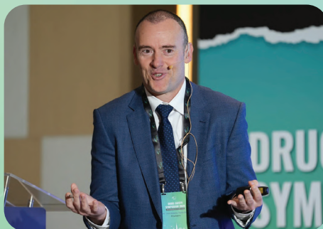
Brand yourself as Voice of the Industry