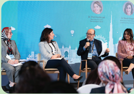
Meet and Learn from the Regulatory Leaders from across the Globe